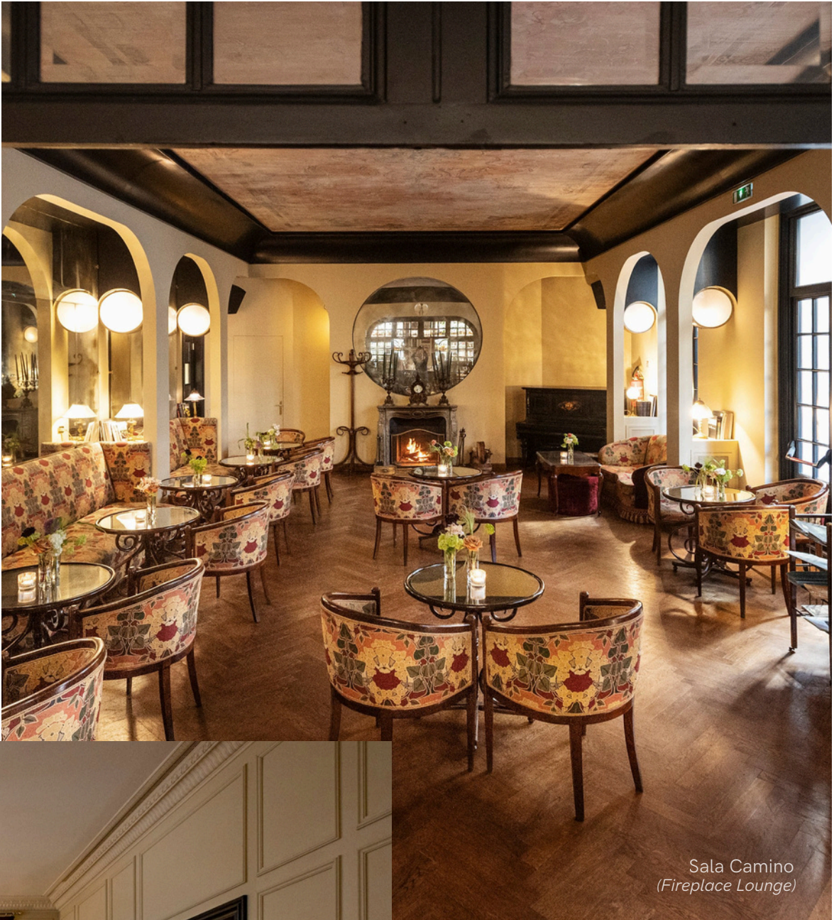
Sala Camino (Fireplace Lounge)