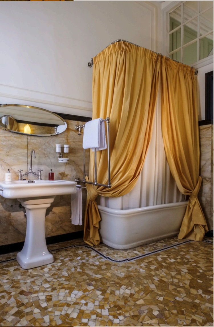
Prestige Deluxe Matilde di Canossa