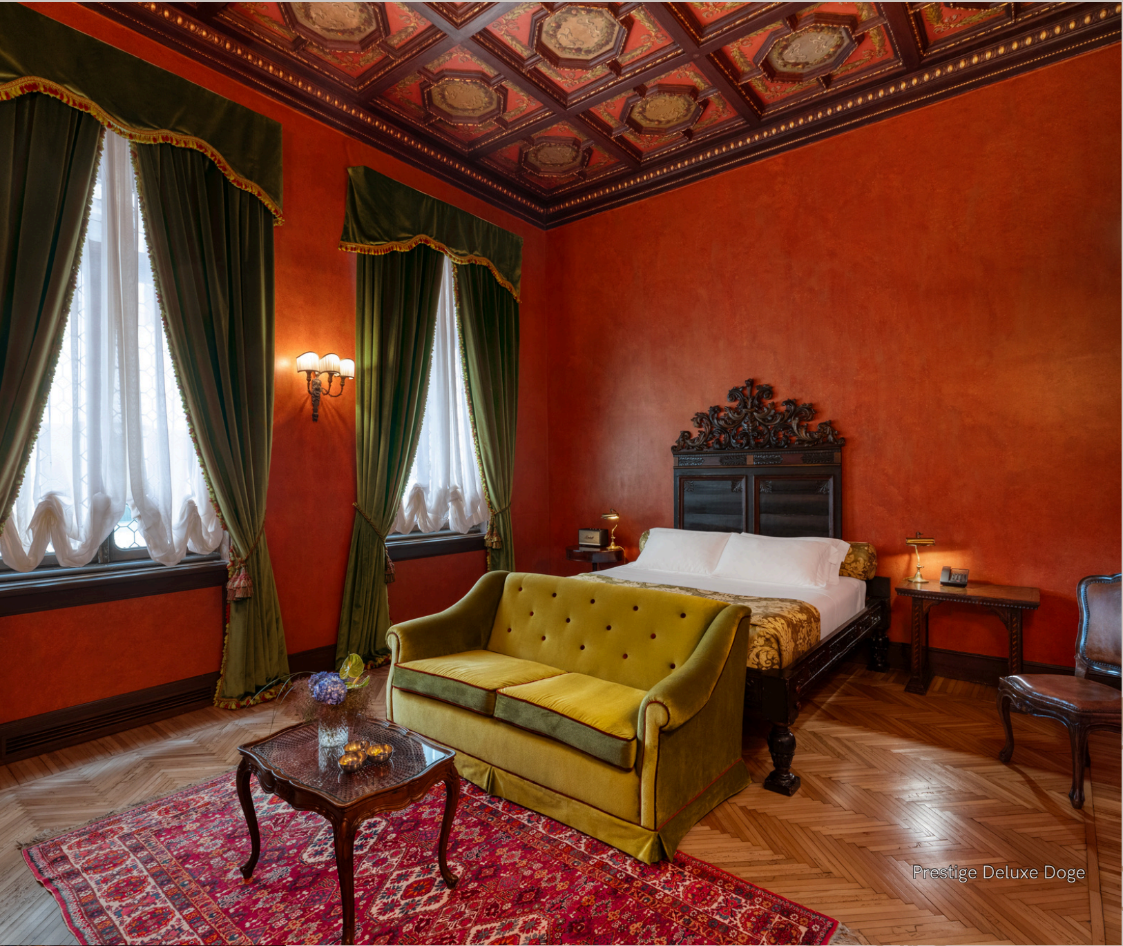
Prestige Deluxe Doge