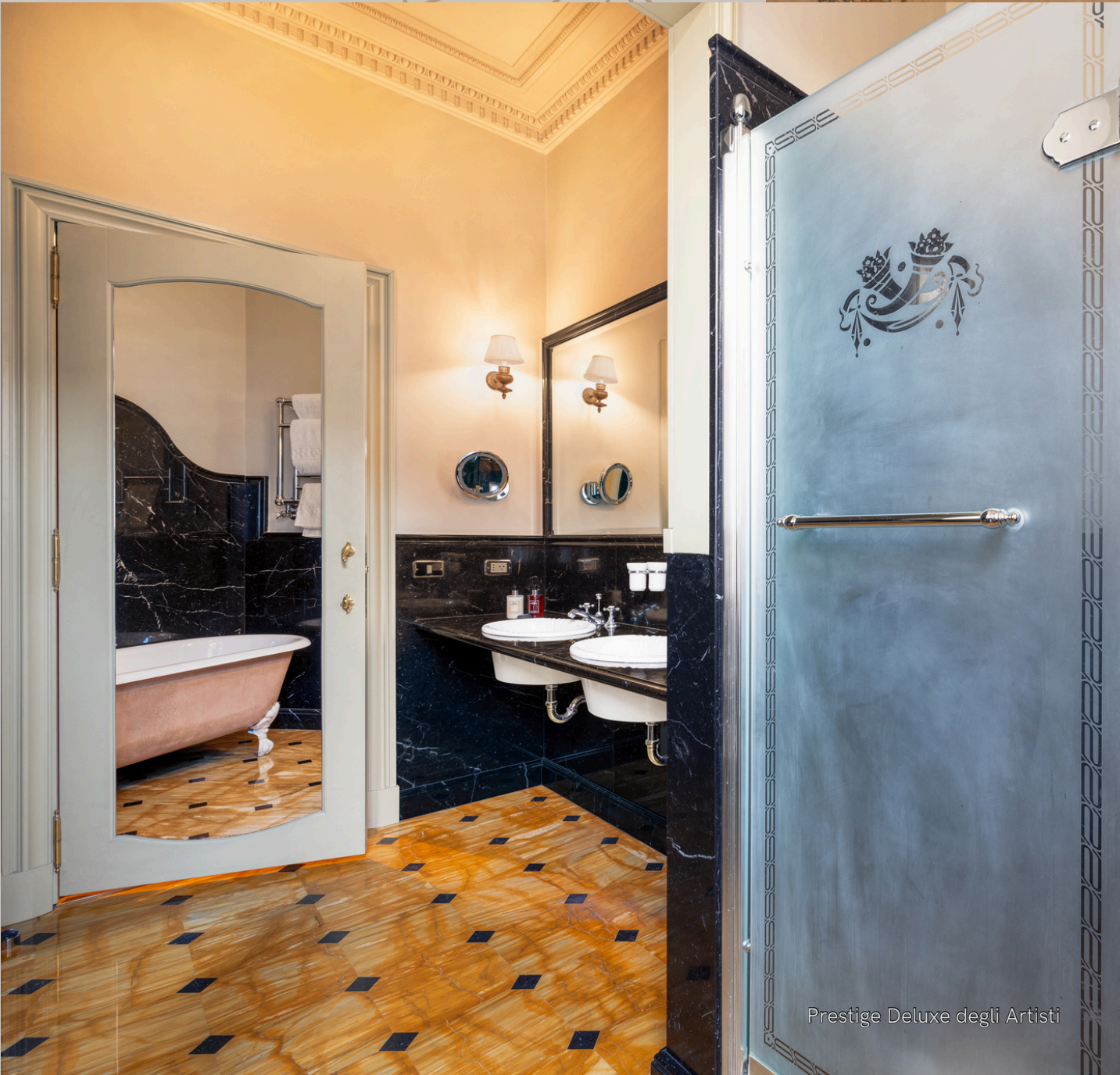
Prestige Deluxe degli Artisti